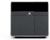
ProJet MJP 2500 Plus