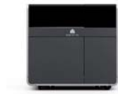
ProJet MJP 2500

Functional precision plastic and elastomeric parts with the ProJet® MJP 2500 Series