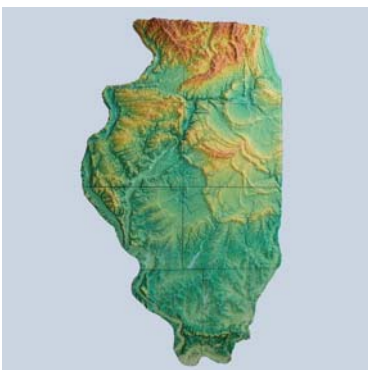
Topography model North America

Do you already have a digital terrain model of your planning area? This allows you to reuse valuable data several times and print your model with them.