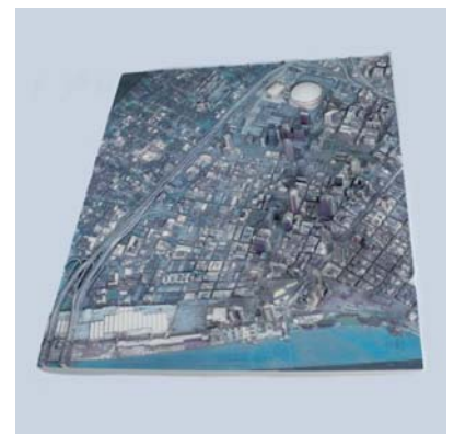
City model New Orleans

Terrain models can be amended with aerial images, maps or any geographical information. This will give you highly accurate and descriptive topographical models.