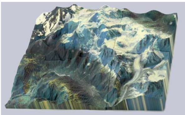
Alpine region Charmonix

3D printing is also suited for urban planning models, where it helps create contrasting colours for complex structures, new construction and planning areas thus making them visible.