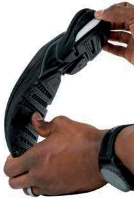
Shoe sole printed in a combination of flexible black elastomer and rigid white plastic

MJP offers exceptional resolution with layer thicknesses as low as 13 microns. Selectable print modes let you choose the best combination of resolution and print speed, so it's easy to find a combination that meets your needs. Parts have smooth finish and can achieve accuracies approaching SLA precision for many applications.