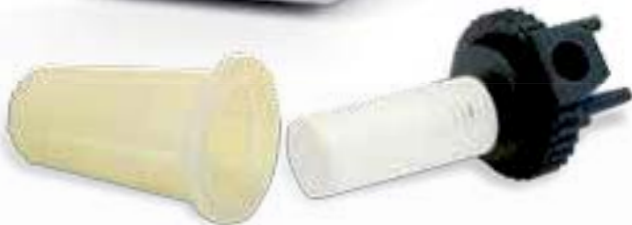
Functional filter prototype printed in clear, white and black rigid plastics

VisiJet M3 materials line delivers toughness, durability, stability, high temperature resistance, watertightness, biocompatibility and castability.